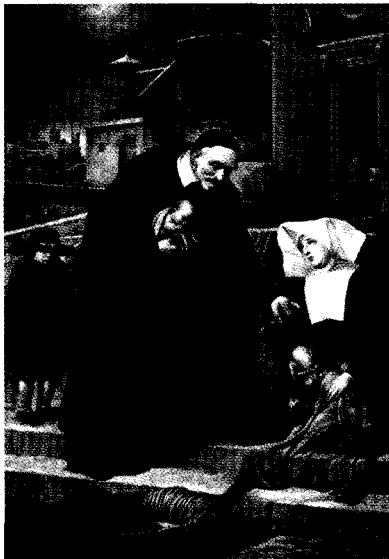
Period painting of Vincent de Paul and the Daughters of Charity aiding those in need.

The Châtillon story, brief as it is, bears careful scrutiny. It is important in understanding the link between Vincent the inspiring preacher and personal caregiver, and the Vincentian family of organizations devoted to the same mission nearly four centuries later. What really happened at Châtillon, and why can it be considered as paradigmatic for Vincent's approach to the organization of charity?