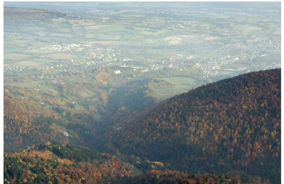
Clockwise from left: Stream in the Jura Mountains (the Torrent) oil painting by Gustave Courbet , View of Gex Area , Jura in Autumn