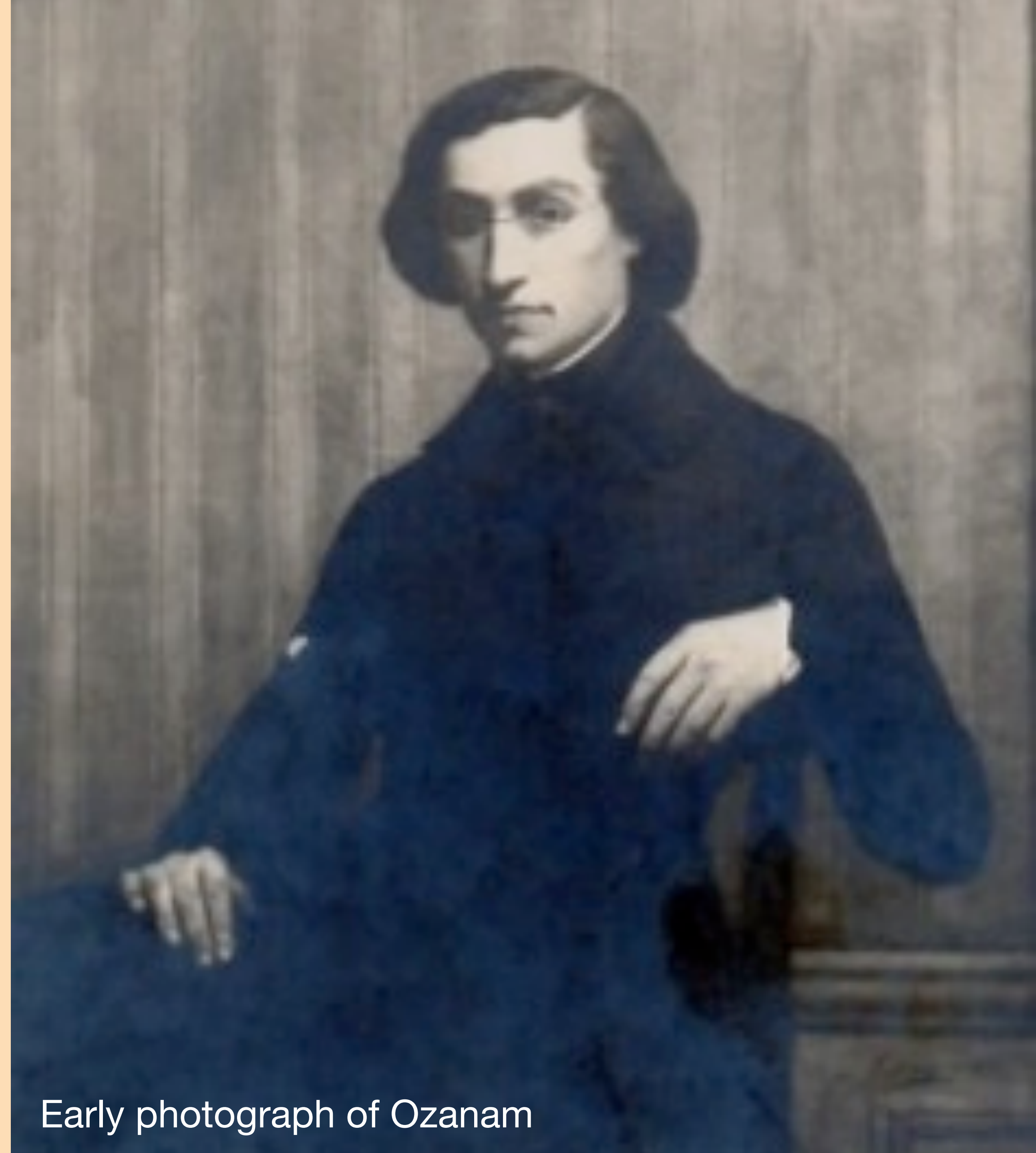
Early photograph of Ozanam