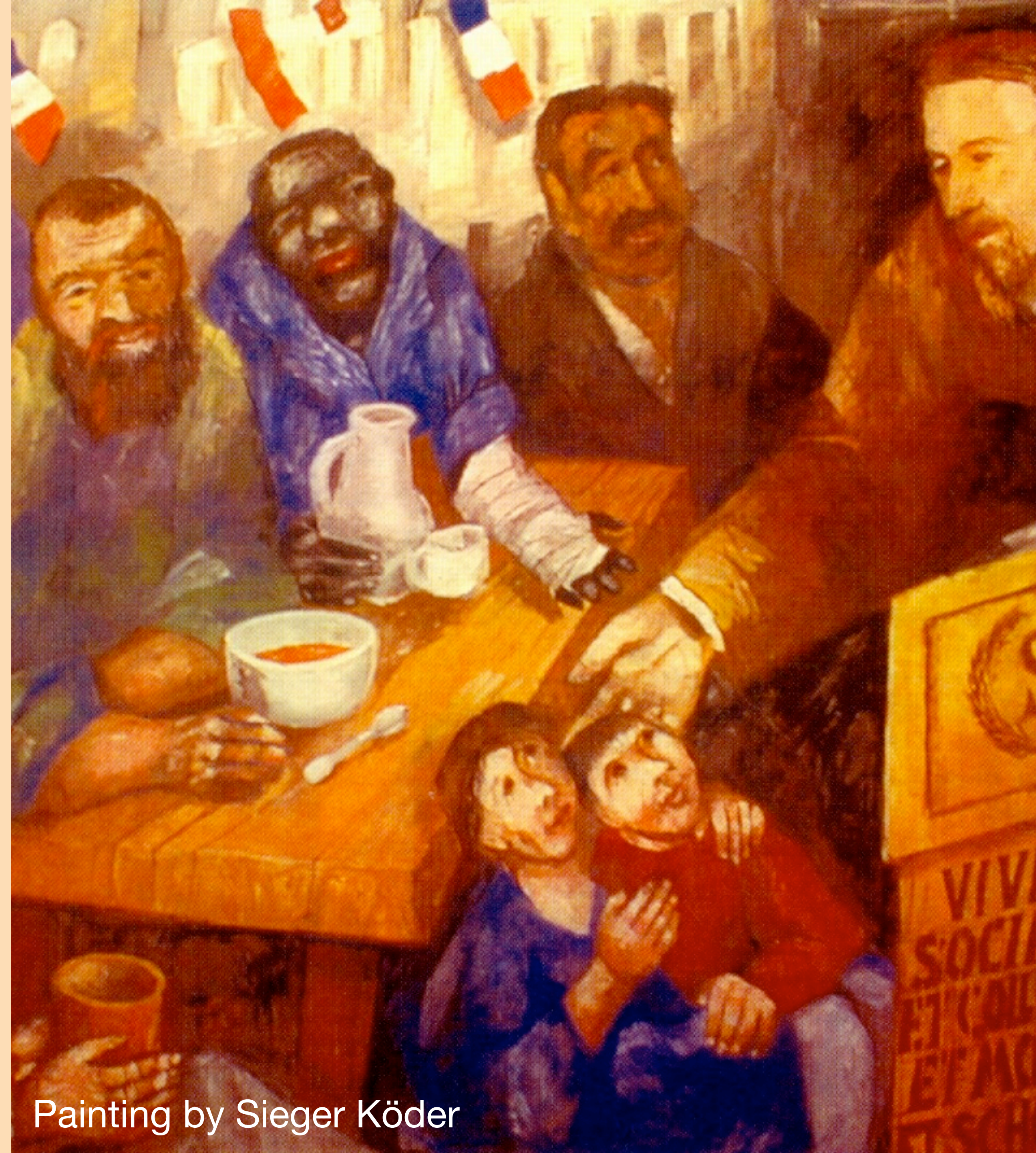
Painting by Sieger Köder