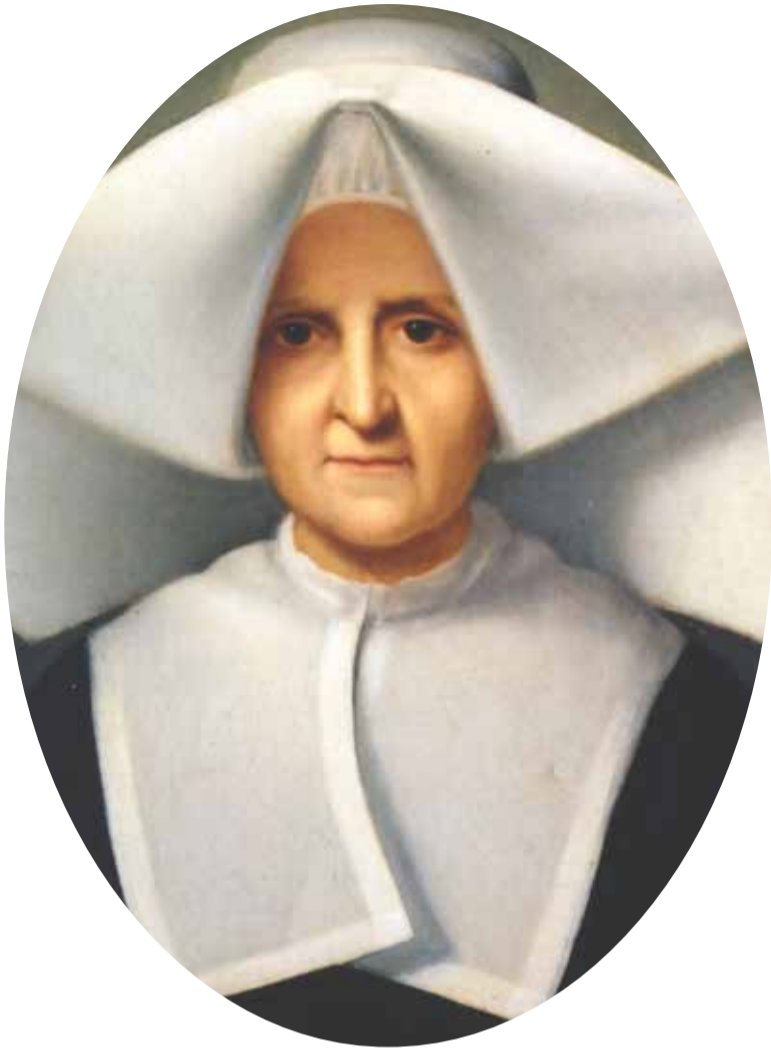
Portrait of Rosalie Rendu, D.C. (1786-1856).

Image collection of the Vincentian Studies Institute