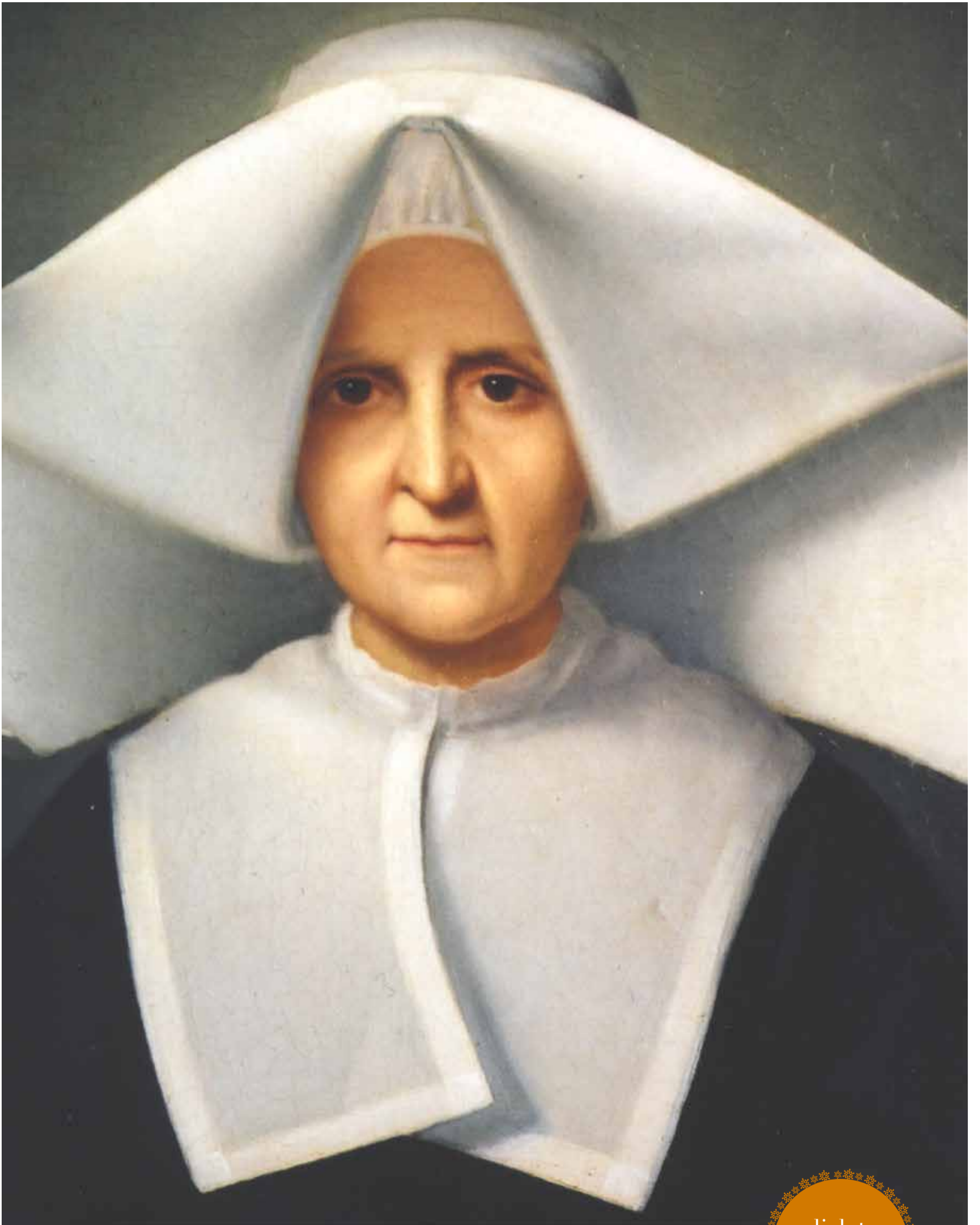
Portrait of Rosalie Rendu, D.C. (1786-1856).

Image collection of the Vincentian Studies Institute