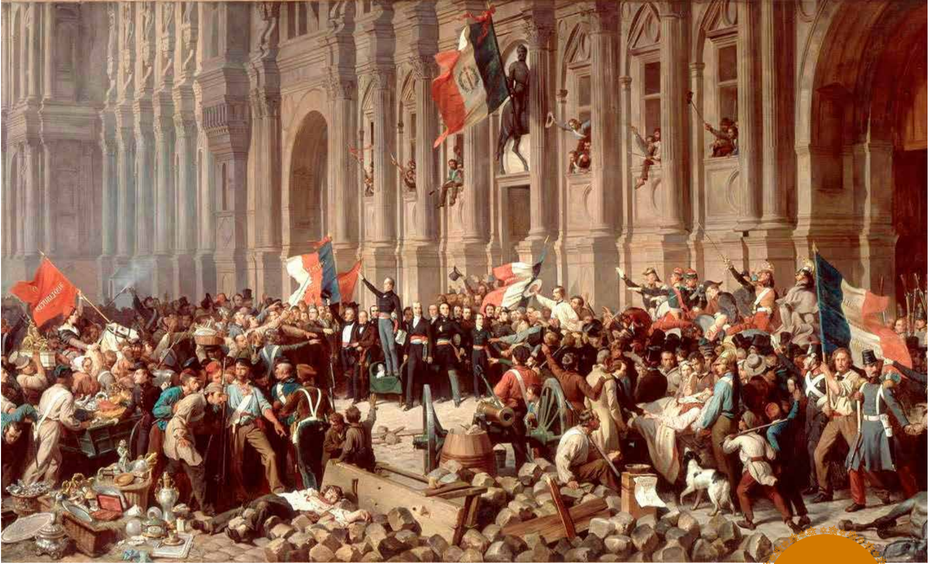
Alphonse de Lamartine, influential in the founding of the Second Republic, stands in front of the Hôtel de Ville, Paris, following the February Revolution of 1848. Painting by Henri Félix Emmanuel Philippoteaux.