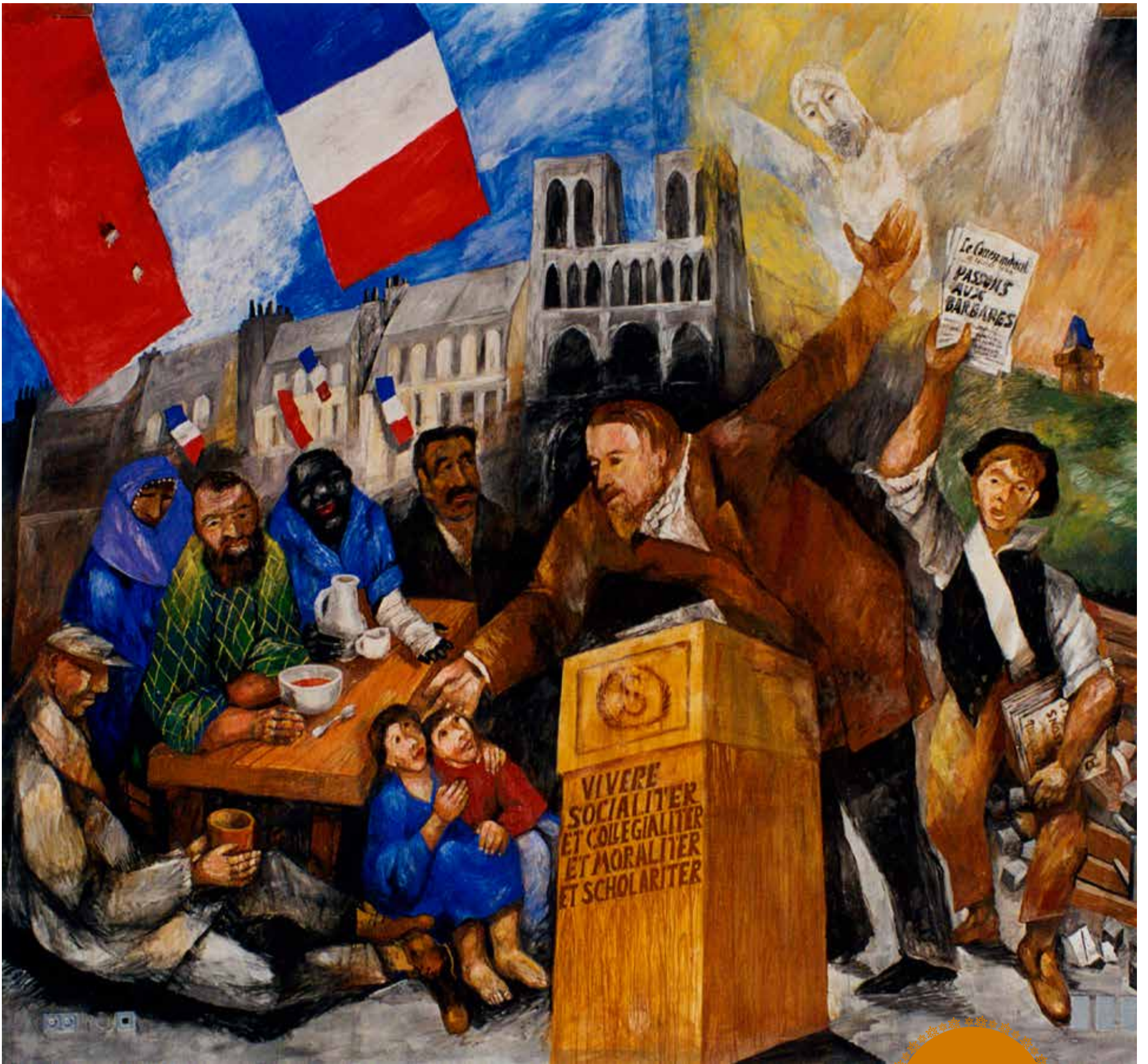
Frédéric Ozanam, from a mural painting of Ozanam by the painter-priest Sieger Köder, located in the parish hall of St. Vincent de Graz, Austria.