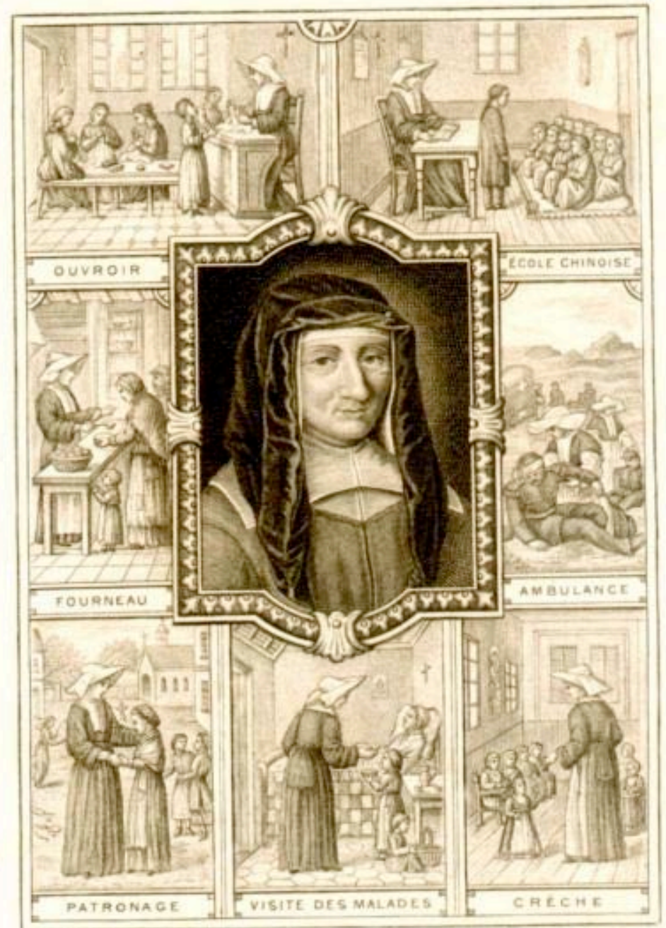
VÉNÉRABLE LOUISE DE MARILLAC FONDATRICE DE LA COMPAGNIE DES FILLES DE LA CHARITÉ

Louise de Marillac would always place a high value on Vincent de Paul's advice and support. They were friends and collaborators in the strictest sense of those words. Yet neither her spirituality nor her leadership style was identical to his.